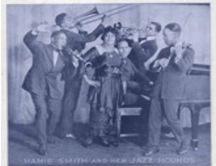
Get this number for your photograph on Okeh Record No. 4169